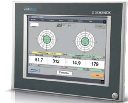
Measuring unit CAB 820

The choice of protective enclosure is determined by the danger the rotor presents, with due consideration to the balancing speed, the method of unbalance correction and the maximum penetration energy of rotor components or fragments. Depending upon the varying protection requirements, ISO 21940-23 specifies five protection classes (0, A, B, C, D) for balancing machines.