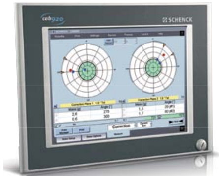
Measuring unit CAB 920